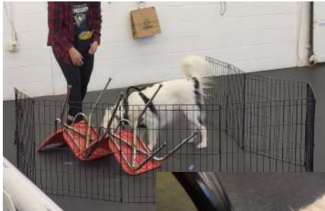
Sal at nose work!