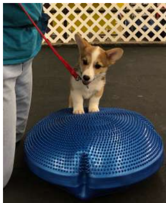
Took some cute puppy pictures from Puppy Confidence class (Bobbie is to the left and Owen is on the right)! Also wanted to share Buffels taking a break from agility class with instructor Hope.