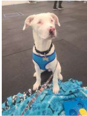
Koa at puppy preschool!